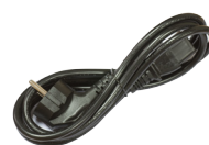
2x IEC cord